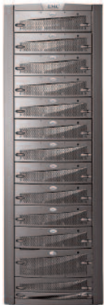
CX3 model 20

CLARiiON CX3 UltraScale series arrays are unique with their cost-effective data-in-place upgrade path to the higher models in the series. Just add the new software and swap storage processing enclosures and you're ready to go.