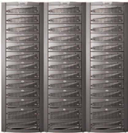
↑ CX3 model 80